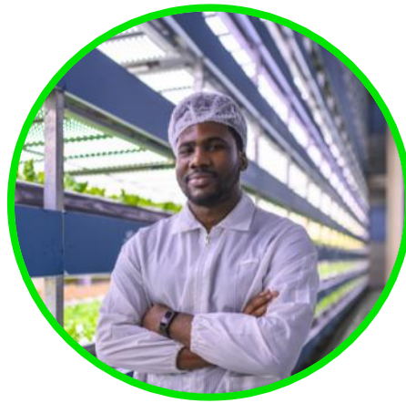
The Plant Sector Advisory Board