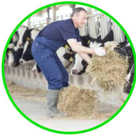
The Animal Sector Advisory Board