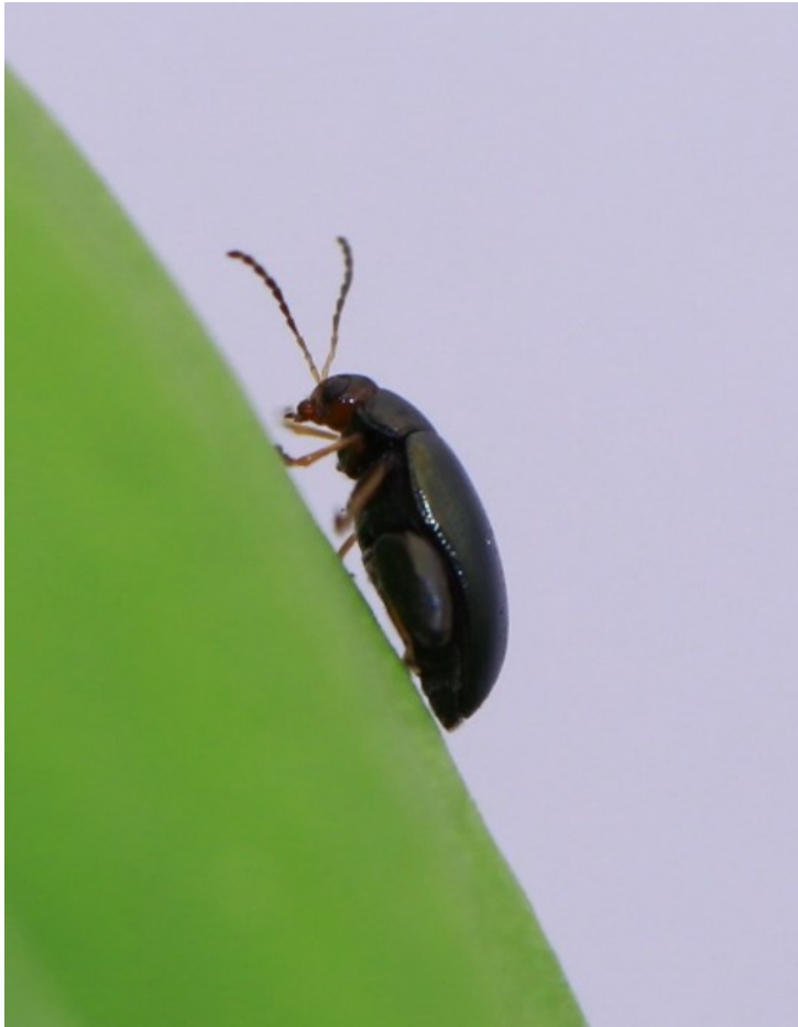
Cabbage steam flea beetle